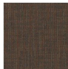
Brazen 83803 LRV 4.3