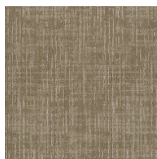
Suede 83755 LRV 13