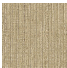
Cork 83170 LRV 19.5