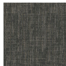
Underground 83505 LRV 3.7