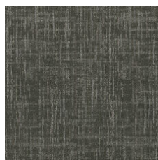
Carbon 83585 LRV 6.7