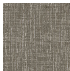
Clay 83761 LRV 10.9