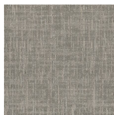
Zinc 83515 LRV 14.1