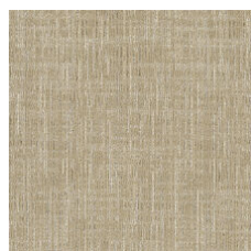
Bisque 83111 LRV 19