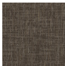
Canyon 83750 LRV 5.3