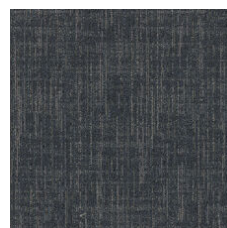
Night 83496 LRV 3.7