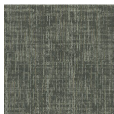
Nuance 83314 LRV 7.4