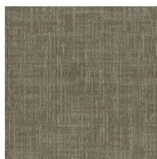
Swept 83322 LRV 8.6